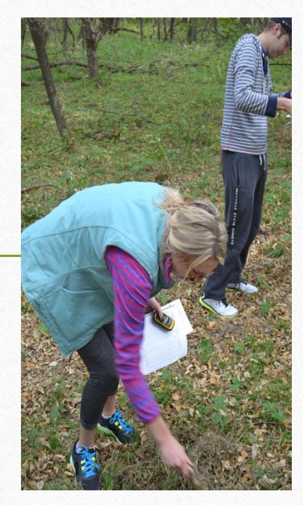
Mapping plant diffusion