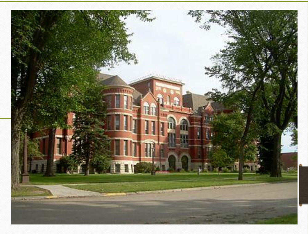
Old Main, MaSU