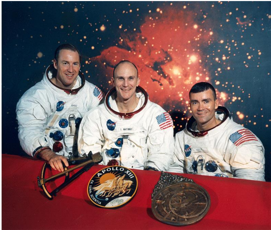
Apollo 13 Astronauts