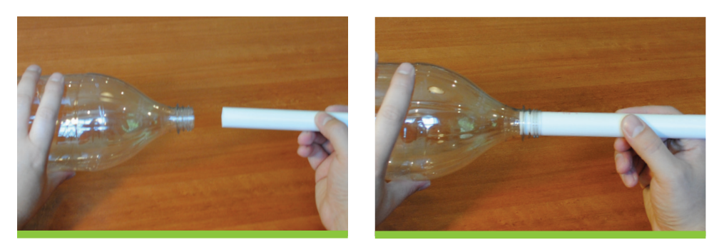
Step 9: Secure the pipe to the bottle using a 4" long piece of duct tape.

Step 8: Insert the 12" PVC pipe piece into the mouth of the two-liter bottle. It will be a snug fit.